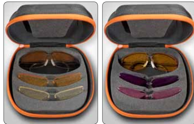
Decot Revel Action Shooting & Hunting Package