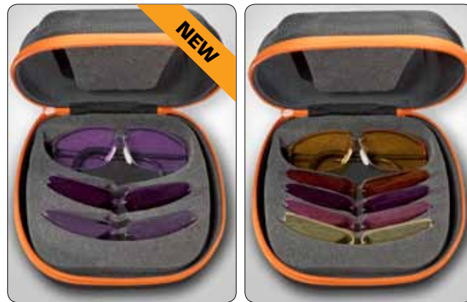
Decot Revel ColorMag Package

And for the shooting enthusiast that does a bit of everything, the Ultimate Package contains all of the lenses from both the Clays and Hunting Packages.