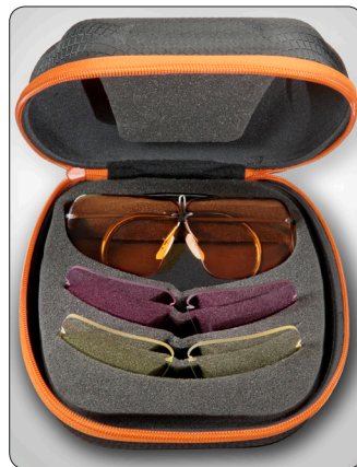
Decot Hy-Wyd Hy-Lo Hunting Package

Made with the same quality spring metal as the Classic Hy-Wyd frame, the Golf frame style has a wider nasal opening that allows the glasses to set lower on the face. This style is designed for everyday wear, and since the lenses are also interchangeable, they convert to sunglasses in an instant with optional lenses available. It comes in the 24K Gold electroplate or the Black non-reflective finish, and comes in two sizes: 61 Standard or 63 Large.