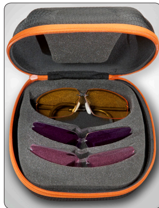
Decot Revel Clays Package

And for the shooting enthusiast that does a bit of everything, the Ultimate Package contains all of the lenses from both the Clays and Hunting Packages.