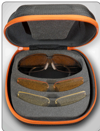
Decot Revel Action Shooting Sports Package