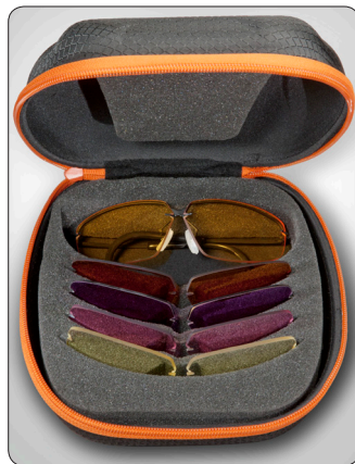
Decot Revel Ultimate Package

Call 1-800-528-1901 | Order online www.decot.com