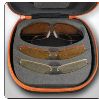
Decot Revel Action Shooting Sports Package