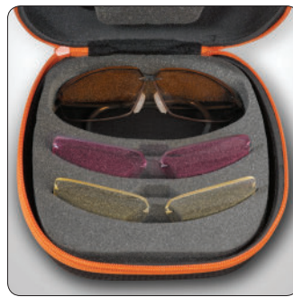
Decot Revel Hunting Package