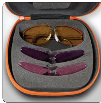
Decot Revel Clays Package