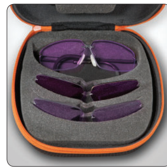
Decot Revel ColorMag Package