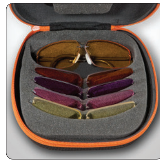
Decot Revel Ultimate Package