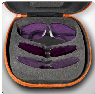
Decot Revel ColorMag Package