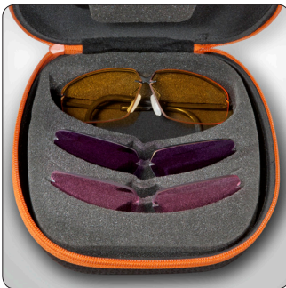
Decot Revel Clays Package