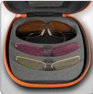
Decot Revel Hunting Package