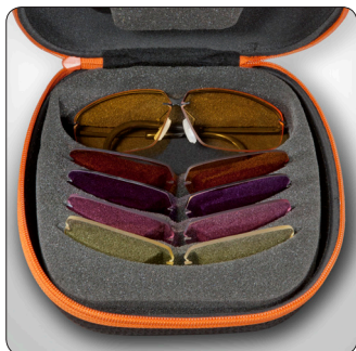
Decot Revel Ultimate Package