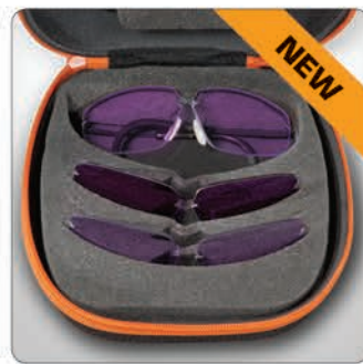
Decot Revel ColorMag Package