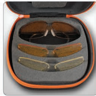
Decot Revel Action Shooting Sports Package