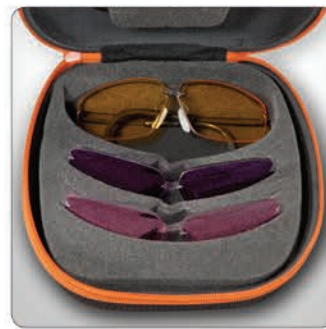
Decot Revel Clays Package