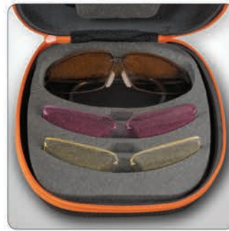
Decot Revel Hunting Package