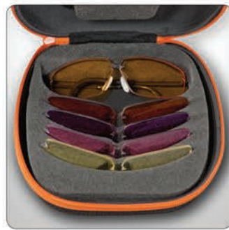
Decot Revel Ultimate Package